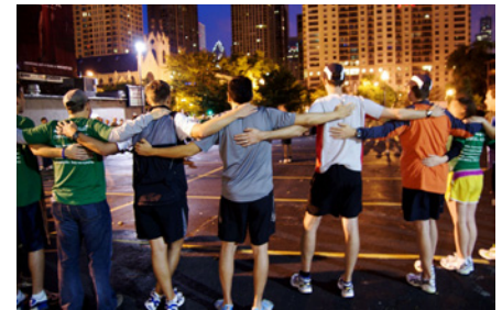
Members and supporters circle-up before each Back on My Feet run.