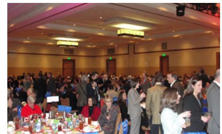
Each Launch Breakfast leaves hundreds of people inspired!